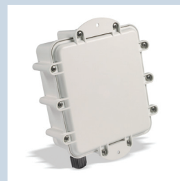
48V Transformer and Power Surge Protector AP-PSBIAS-5181-01R

Not Shown: Wall Pole and Mounting Kit KT-5181-WP-01R