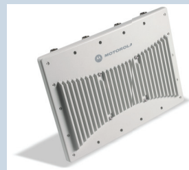
AP-5181 Dual Radio AP AP-5181-13040-WWR