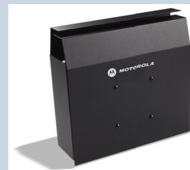
Heavy Weather Kit KT-5181-HW-01R