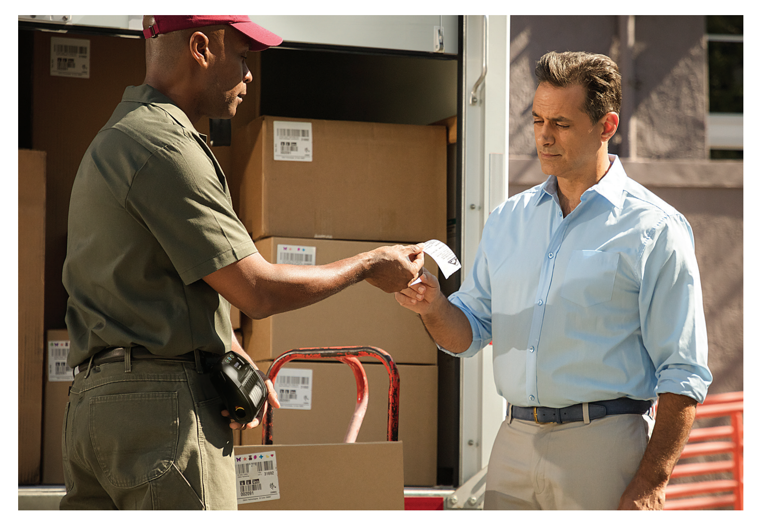
*ZQ220 is not available in NA. Not all products and accessories not available in all regions.