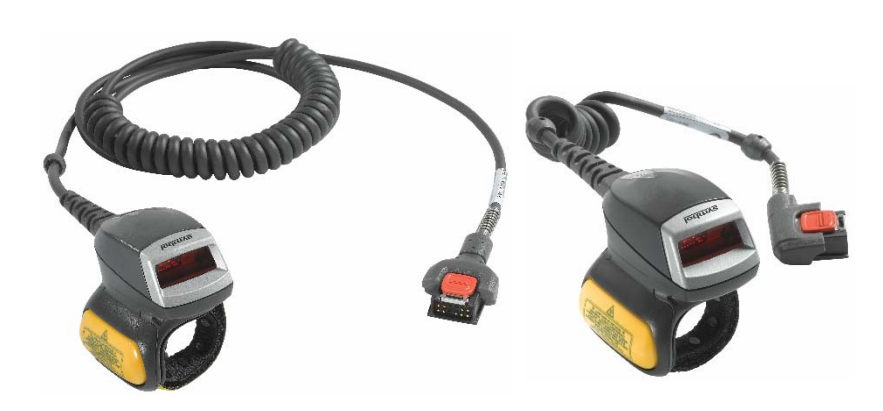
RS419-HP2000FLR Ring scanner for WT41 hip mounted.