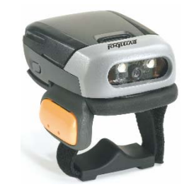
RS507-IM20000STWR Imager with trigger and standard capacity battery