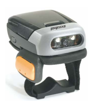
RS507-IM20000STWR Imager with trigger and standard battery