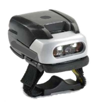
RS507-IM20000ENWR Imager without trigger and extended battery