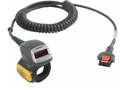
RS419-HP2000FSR Ring scanner with cable to wrist