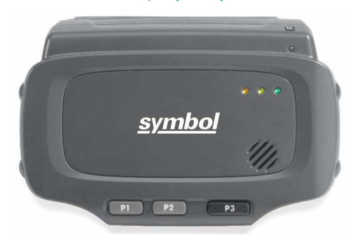
WT41N0-V1H27ER Voice only wearable